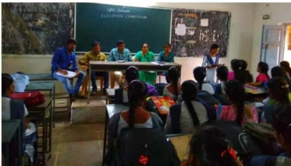
JKC STUDENT SEMINAR CONDUCTED IN CLASS ROOM