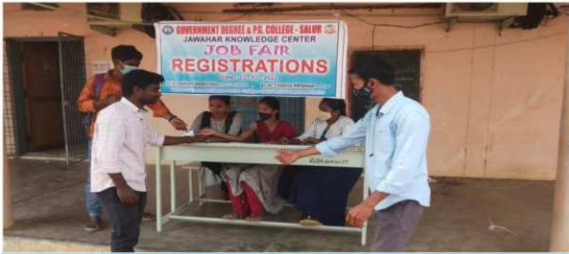
Job Drive Students Registrations