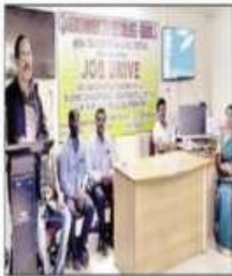
జూనియర్ కాలేజీ, ప్రభుత్వ కళాశాల, విజయవాడ

పాఠశాల, హైస్కూల్, కాలేజీల్లో ఉన్న విద్యార్థులు, కుటుంబ సభ్యులు అందరూ యువ అవకాశ కేసు ద్వారా ఉద్యోగం పొందే అవకాశం ఉన్నందున దీనిని సరిగ్గా ఉపయోగించుకోవాలి. ఈ కార్యక్రమం ద్వారా విద్యార్థులు, కుటుంబ సభ్యులు ఉద్యోగం పొందే అవకాశం ఉన్నందున దీనిని సరిగ్గా ఉపయోగించుకోవాలి. ఈ కార్యక్రమం ద్వారా విద్యార్థులు, కుటుంబ సభ్యులు ఉద్యోగం పొందే అవకాశం ఉన్నందున దీనిని సరిగ్గా ఉపయోగించుకోవాలి.