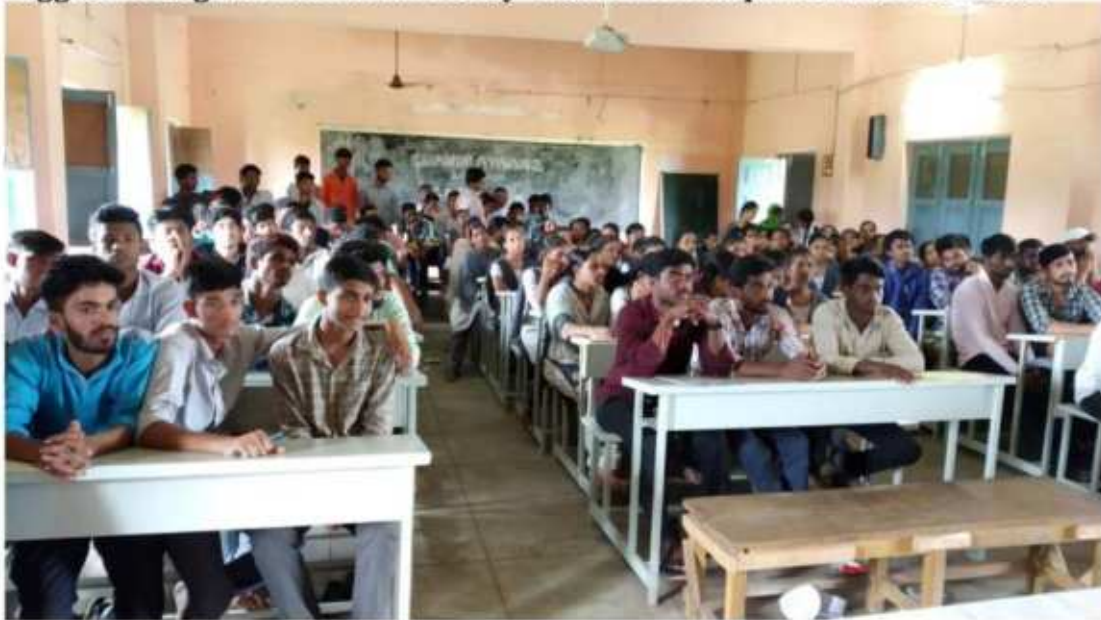
Candidates from different places attended to Job Drive