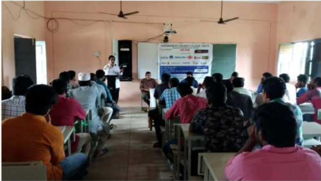
Suggestions given to candidates by Hon'ble Principal Dr.V.Suresh Babu