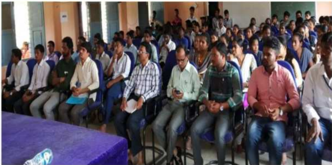
Candidates from different places attended to Job Drive