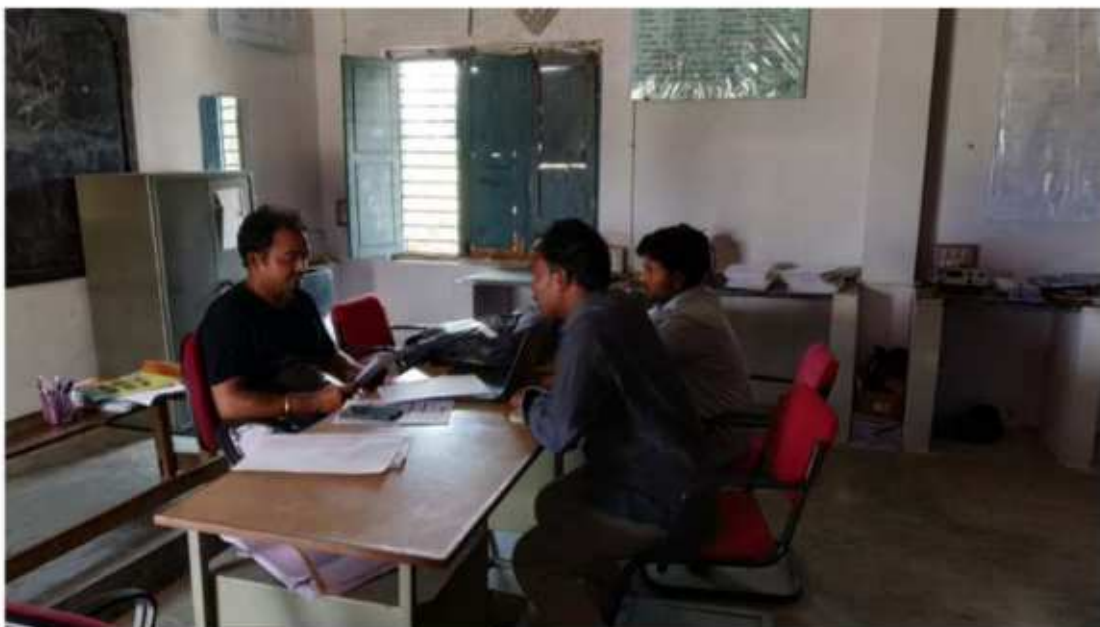
HR Recruiter interviewed his job seekers