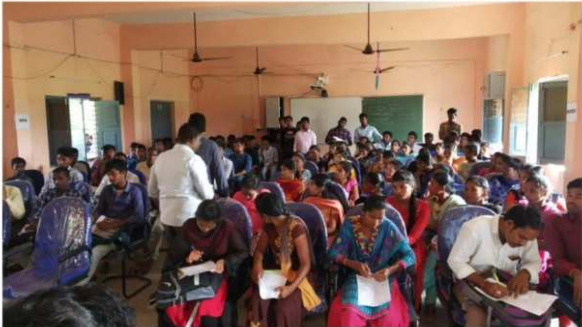
Candidates filled the their details in Bio Data Sheet