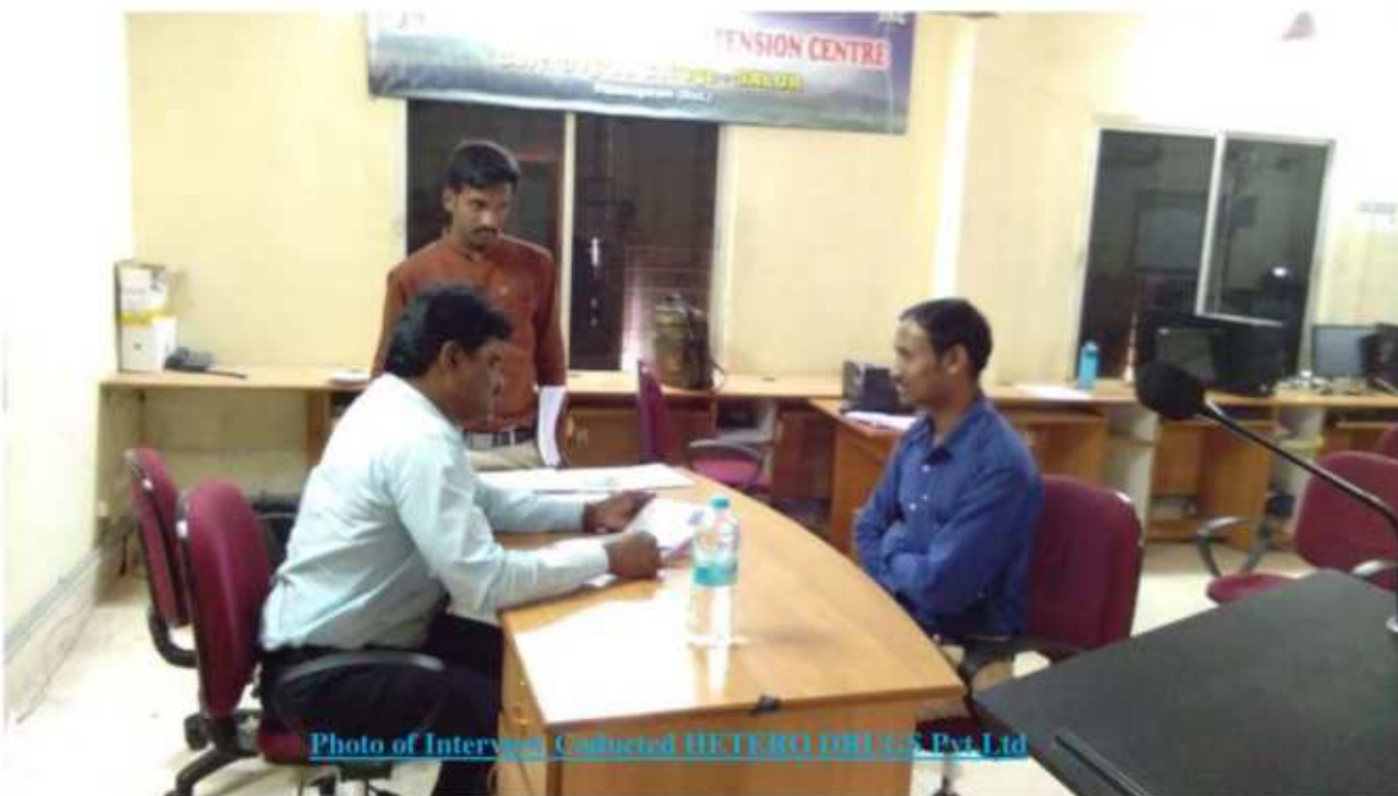
Photo of Interview Conducted HETERO DRUGS Pvt Ltd