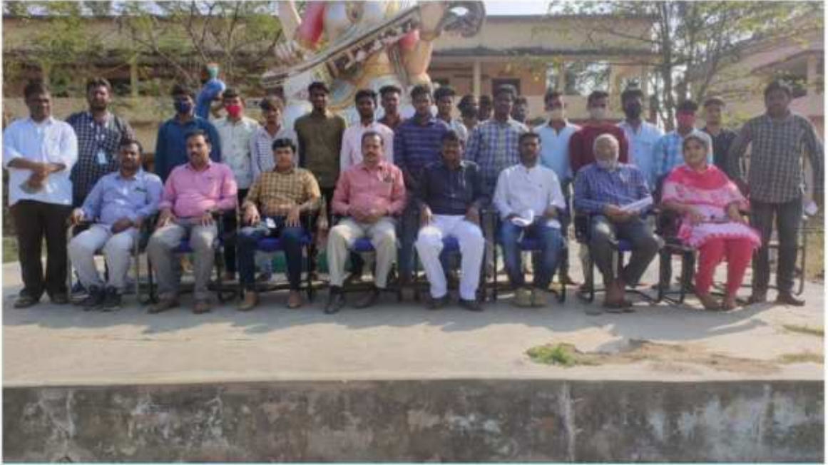
Government Degree College-Salur Photo with selected Candidates