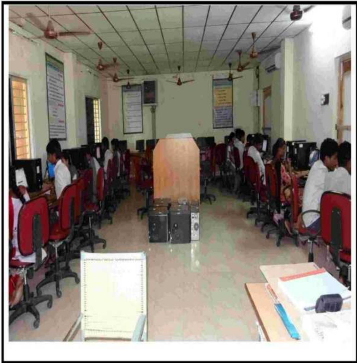
JKC Lab Govt. Degree College Salur, Vizianagaram District