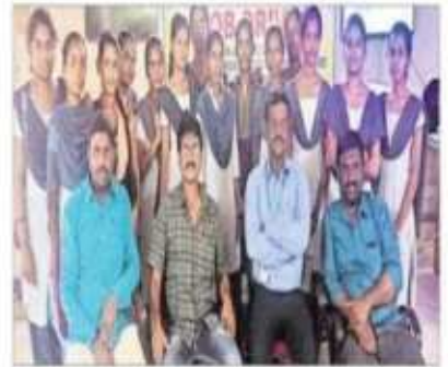
ఉద్యోగం కోసం ఉద్యోగం

ఆంధ్రజ్యోతి Jan. 08 January 2019 https://appaper.andhrajyothi.com/