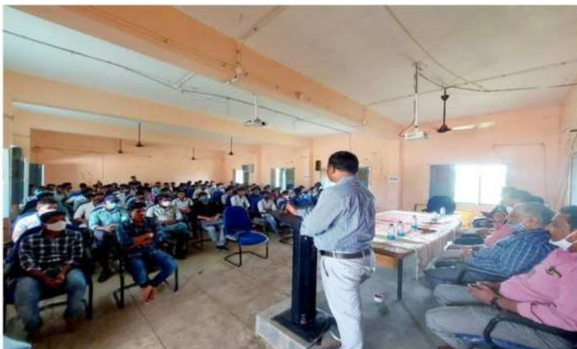
IQAC Coordinator delivered his speech addressed to candidates