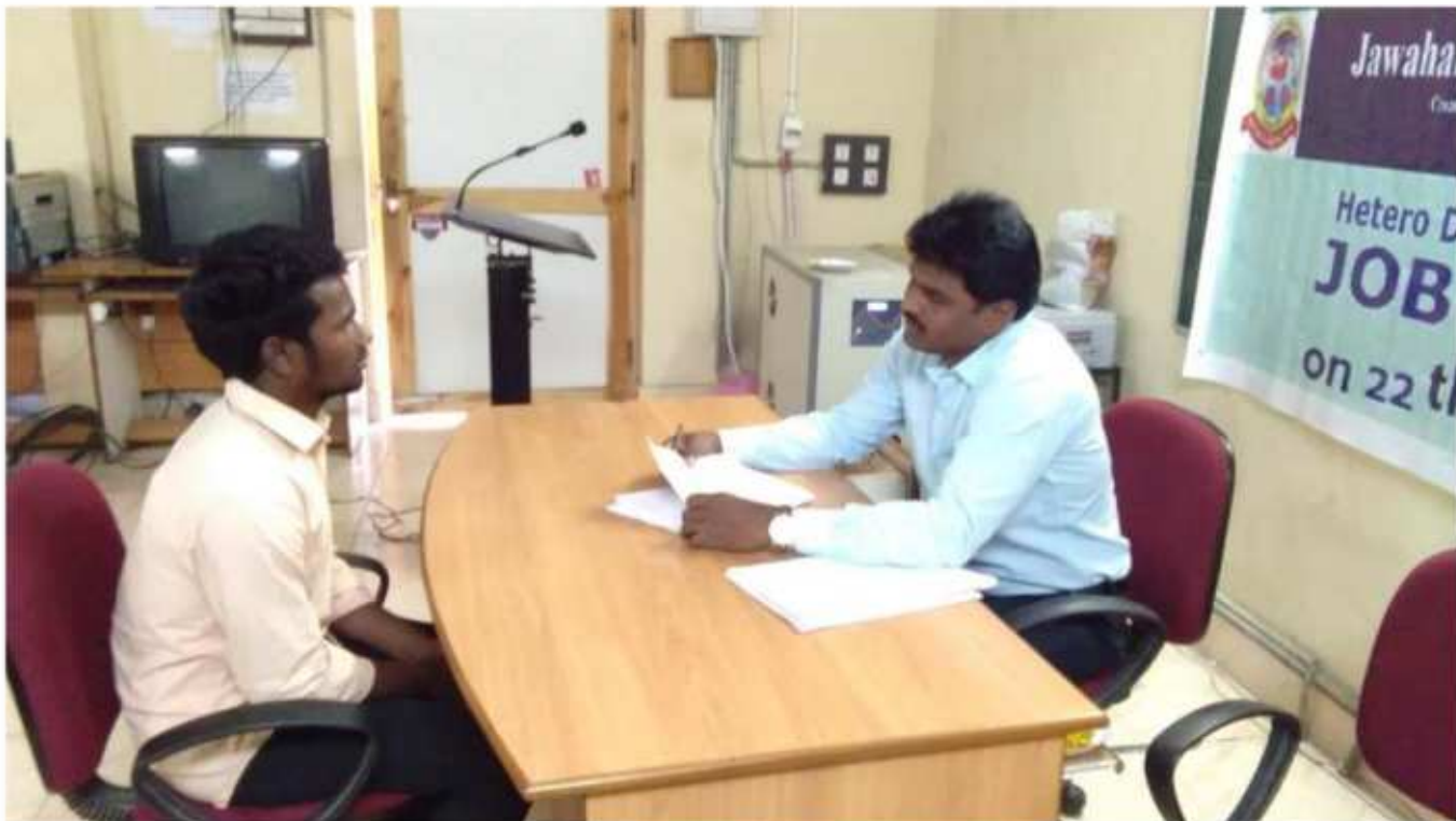
Photo of Introducing companies Profile