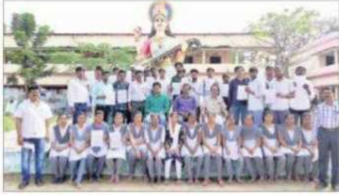
ఎంపికైన వారితో అధ్యాపకులు

సాలూరు: జవహర్ నాలెడ్జ్ సెంటర్ (జేకేసీ) ఆధ్వర్యంలో పట్టణంలోని ప్రభుత్వ డిగ్రీ కళాశాలలో బుధ వారం నిర్వహించిన జాబ్ మేళా విజయవంతమయింది. హెటీరో డ్రగ్స్ ప్రైవేటు లిమిటెడ్, ఆర్ఎస్ఎంఐపీ ఎల్ మొబైల్ అసెంబ్లీంగ్ ఆపరేటర్, ఇండిగో ఎయిర్లైన్స్, ఇన్నోవ్ సోర్స్ కంపెనీల్లో ఉద్యోగాలకు నిర్వహించిన ఇంటర్వ్యూలకు కళాశాల విద్యార్థులతో పాటు ఇతరులు 136 మంది హాజరయ్యారు. వీరిలో 26 మందిని ఎంపిక చేసినట్లు నిర్వాహకులు తెలిపారు. కళాశాల ప్రిన్సిపాల్